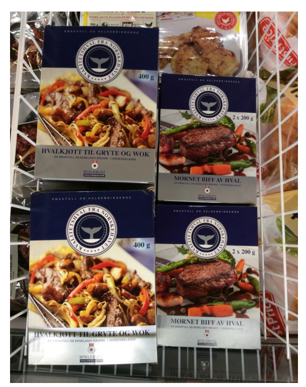
Whale products on sale in SPAR, Bergen

the disposal of several shipments of Norwegian whale products due to high levels of the pesticides aldrin and dieldrin, in excess of Japanese human health standards.<sup>15</sup>