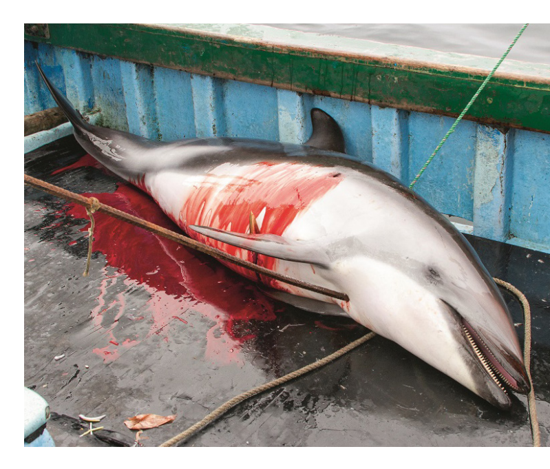
Harpooned dusky dolphin, to be used as bait in Peruvian fisheries