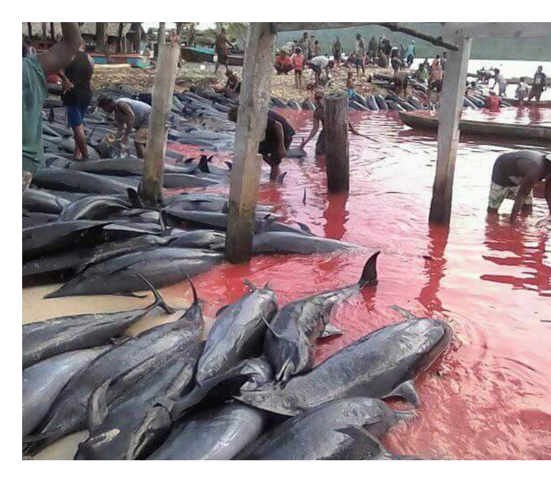
Dolphin hunt, Solomon Islands

The value of dolphin teeth increased from US$0.14/ tooth in 2004 to $0.70/tooth in 2013, providing villagers more incentive to hunt (Oremus et al. 2015). In 2013, the IWC Scientific Committee expressed concern regarding the potential depletion of local populations, given the scale of the recent (and historical) catches (IWC SC 2013, p. 67). Furthermore, DNA analysis has revealed the limited connectivity of local bottlenose dolphin populations and, consequently, a low likelihood for repopulation after offtakes if a local population is extirpated (Oremus & Garrigue 2015).