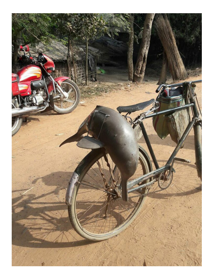
Poached Gangetic dolphin, Bhabanathtola, Malda district, West Bengal, December 2017

South Asian river dolphin ( Platanista gangetica ), Indo-Pacific finless porpoise ( Neophocaena phocaenoides ), spinner dolphin ( Stenella longirostris ), common dolphin ( Delphinus delphis ), Indo-Pacific humpback dolphin ( Sousa chinensis ), Indian Ocean humpback dolphin ( Sousa plumbea ), Indo-Pacific bottlenose dolphin ( Tursiops aduncus ), common bottlenose dolphin ( Tursiops truncatus ), pantropical spotted dolphin ( Stenella attenuata ), Risso's dolphin ( Grampus griseus ) Numbers killed: thousands a year Type of hunt: directed hunts (gillnets)