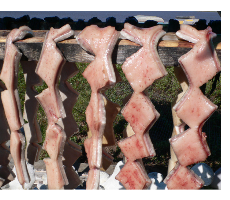
Beluga blubber drying at Point Lay, Alaska

(e.g., 2007, when the number of animals killed peaked at 270), annual kill rates have been up to 3.6 times the recommended level (Environmental Investigation Agency 2014, Allen & Angliss 2010). In the EBS, the number of whales killed in subsistence hunts has risen since the 1990s from an average of 130 during 1994–1998 to 193 during 2005–2009 (Environmental Investigation Agency 2014). The US Marine Mammal Commission (MMC) has raised concerns over the recent failure of the US to include struck and lost data for subsistence hunts in Alaska (MMC 2018).