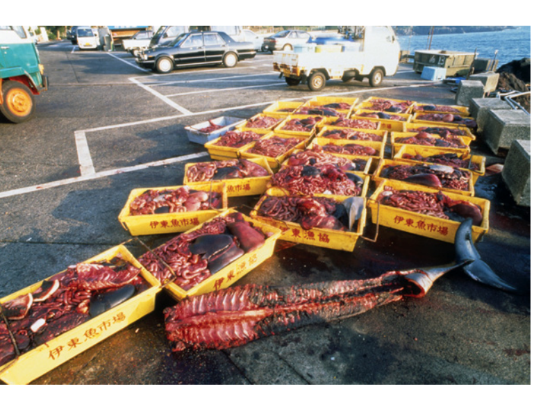
Body parts of small cetaceans, Japan

Dall's porpoise (Phocoenoides dalli, dalli- and truei-types), short-finned pilot whale (Globicephala macrorhynchus, northern and southern forms), Risso's dolphin (Grampus griseus), Pacific whitesided dolphin (Lagenorhynchus obliquidens), false killer whale (Pseudorca crassidens), pantropical spotted dolphin (Stenella attenuata), striped dolphin (Stenella coeruleoalba), common bottlenose dolphin (Tursiops truncatus), Baird's beaked whale (Berardius bairdii), rough-toothed dolphin (Steno bredanensis), melon-headed whale (Peponocephala electra), Hubbs' beaked whale (Mesoplodon carlhubbsi), ginkgo-toothed beaked whale (Mesoplodon ginkodens), Indo-Pacific bottlenose dolphin ( Tursiops aduncus ), pygmy sperm whale (Kogia breviceps), dwarf sperm whale (Kogia sima), Northern right whale dolphin (Lissodelphis borealis), orca (Orcinus orca) Numbers killed: less than 3,000 a year; after a constant decline from 46,000 in 1993 Type of hunt: directed hunts (acoustic drive hunts, harpoons, spears, knives)