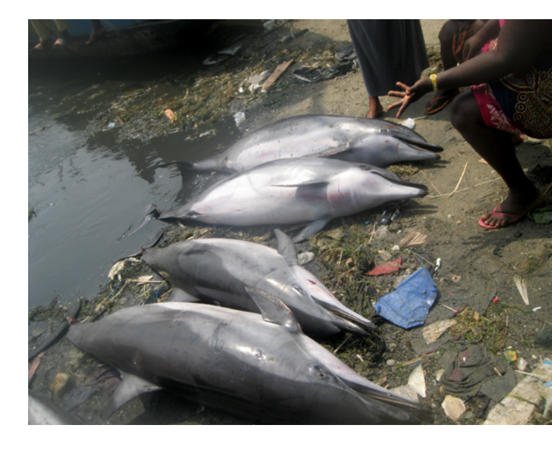
Dead Clymene dolphins

The exploitation of small cetaceans for food and, to some extent, for medicinal use was reported to occur on a minor scale during the 1990s despite such use violating national laws (Cosentino & Fisher 2016). To avoid being caught engaging in an illegal act, fishers dumped carcasses at sea or buried them on the beach (Van Waerebeek et al. 2000). Today, there is a limited trade in dolphin carcasses (many of them bycaught in shark and barracuda fisheries) for food and medicinal treatments (Leeney et al. 2015). In 2015, an entire carcass sold for US$6. The expert flensing skills exhibited by locals suggests that cetacean landings are common (Van Waerebeek et al. 2003). Indeed, 59 per cent of fishers interviewed (n=79) admitted to eating dolphin meat (Leeney et al. 2015).