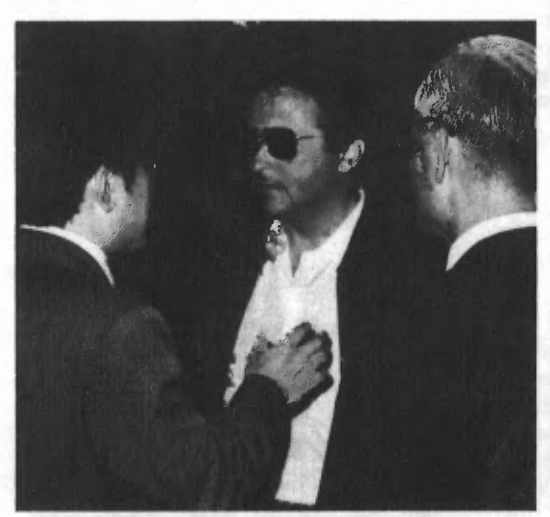
A tension-filled discussion among whaling nation delegates