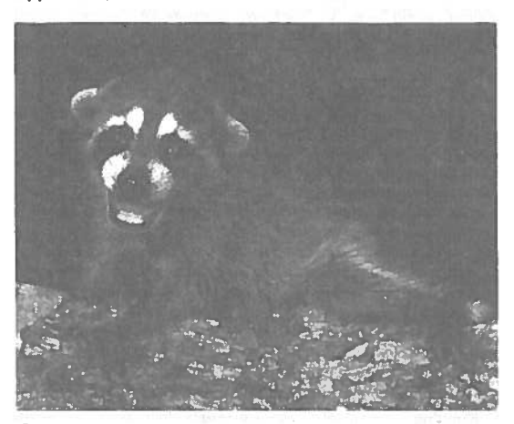
Cover photo: Orphaned Raccoon raised by the Suncoast Sea Bird Sanctuary and now restored to the wild.

The new edition of Facts About Furs is now available from the Animal Welfare Institute. Based on four years of research by AWI staff, the book is a comprehensive account of the fur trade and the animals involved in it. Illustrated with 79 photographs, many beautiful studies of animals in the wild, others giving sorry documentation of frenzied battles with the steel trap, the 258-page book contains 47 charts, tables and maps, 18 appendices, and an index.