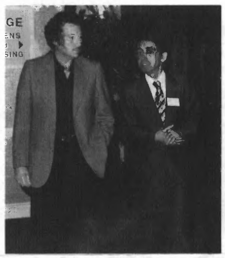
Peruvian Commissioner de Rivero and Japanese Commissioner Yonezawa voted hand in hand against whale conservation measures.