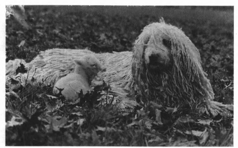
Komondor cares for young lamb.