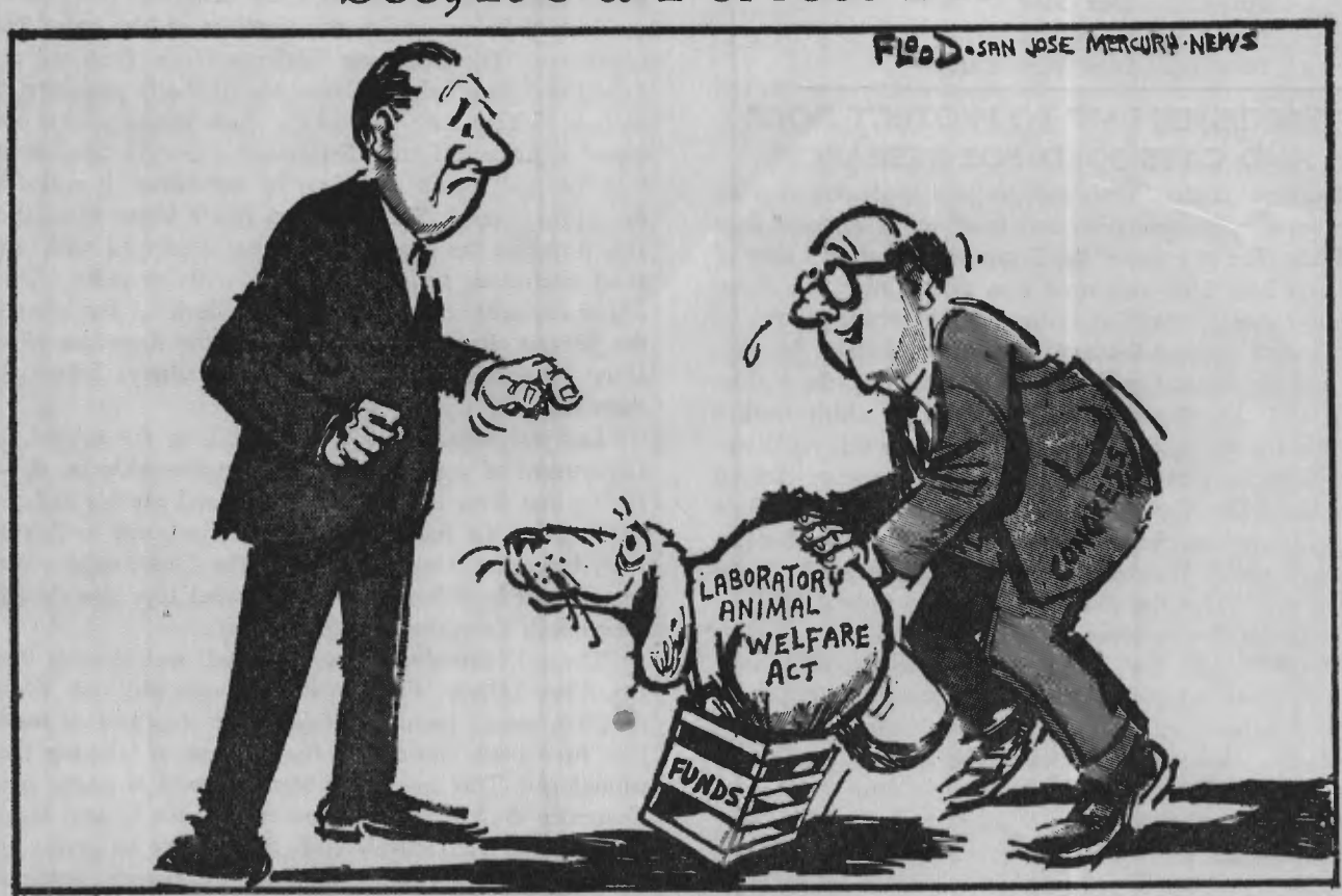
Cartoon from THE SAN JOSE MERCURY NEWS, JULY 16, 1967